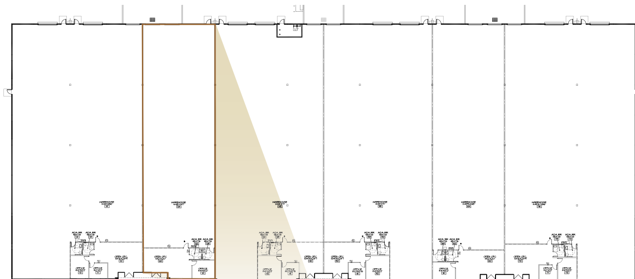
Building 8 Spec Suite 8